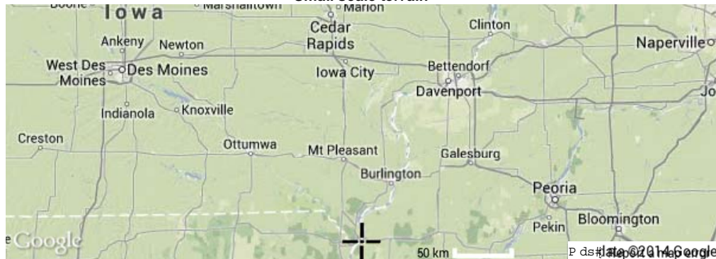
Small scale terrain